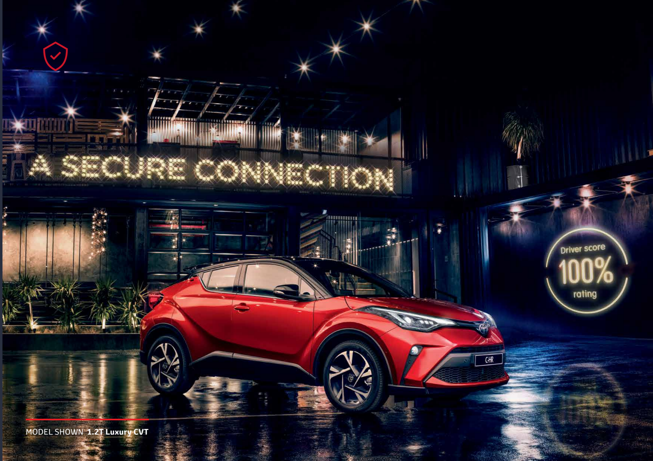
MODEL SHOWN 1.2T Luxury CVT