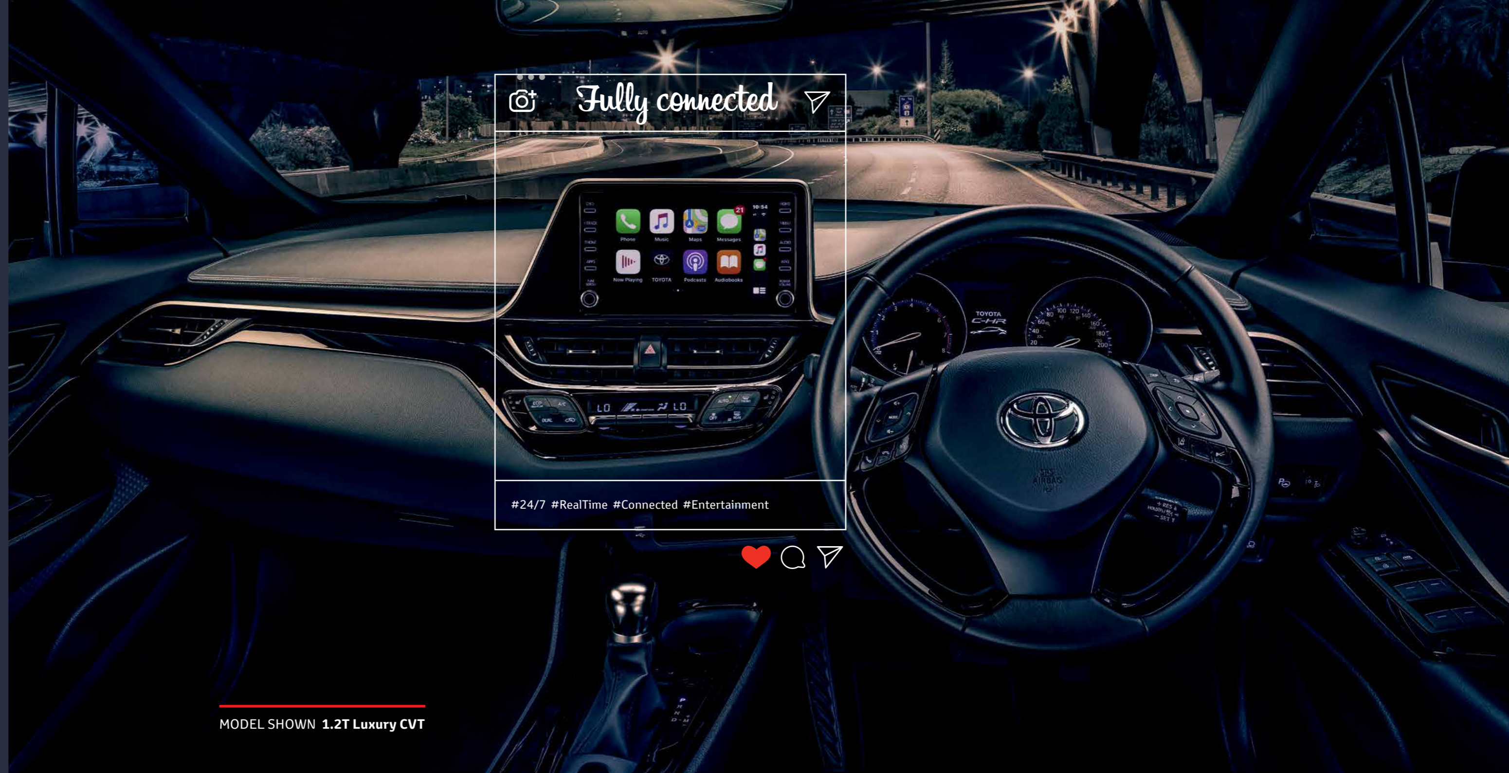
MODEL SHOWN 1.2T Luxury CVT